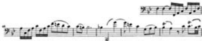
Figure 5. Breitkopf Edition with Miller's Markings, mm. 45-50.

In measure 50 there is a new problem: one I find interesting and fascinating (Figure 5). This measure