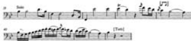
Figure 1. Universal Edition of the Opening to the Mozart Bassoon Solo, mm. 35-42.

In the music of Mozart trills are a matter of conjecture. It comes down to musical instincts and taste. Quite a few well-known Mozart interpreters, particularly those I consulted before I did my 1984 recording of the work - Neville Marriner, Alfred Brendel, and Joseph Silverstein and the like, hold a similar opinion