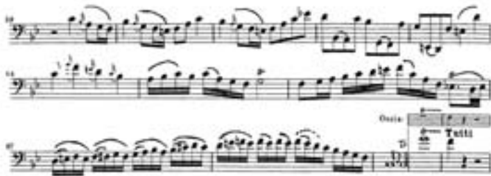
Figure 8. Breitkopf Edition with Miller's Markings, mm. 59-71.