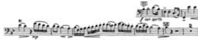
Figure 2. Guetter's Edition of the Opening to the Mozart Bassoon Solo, mm 35-42.