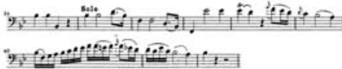
Figure 3. Breitkopf Edition with Miller's Markings to the Opening of the Mozart Bassoon Solo, mm 34-42.