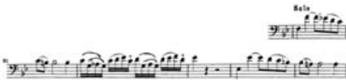
Figure 9. Breitkopf Edition with Miller's Markings, mm. 80-85.